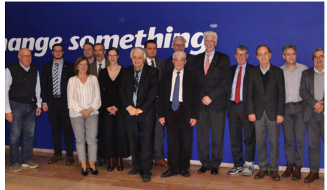
The members of CEAS Board of Trustees, meeting of Berlin 22 November 2019

The ceremony was handing-on the CEAS Medal was ended with a short speech delivered by the recipient, who acknowledged us for this distinction in recognition of his activity for growth of efforts of Europe in Space.