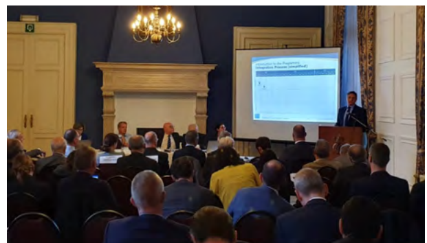
ASD-OCCAR joint seminar on future business opportunities