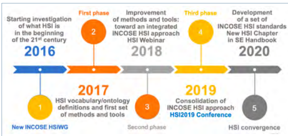
Figure 2. INCOSE HSI Working Group Roadmap.